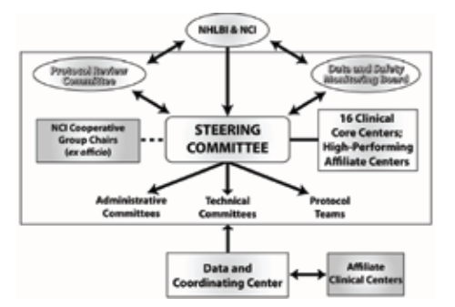
Figure I. BMT CTN Organizational Structure

The BMT CTN is a multifaceted organization (see Figure 1) that is comprised of several interactive components including: