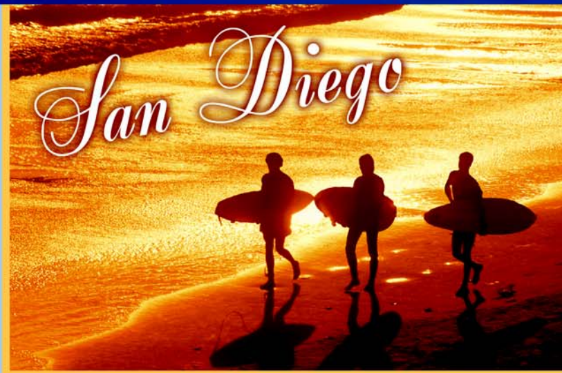
EXHIBIT INFORMATION & COMMERCIAL SUPPORT PROSPECTUS

Early Registration and Abstract Deadline: October 13, 2011