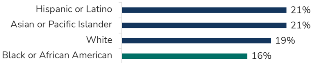
Percent who got BMT by race or ethnicity

About 16% of Black or African American people got BMT; that's compared to about 19-21% of people from other races.